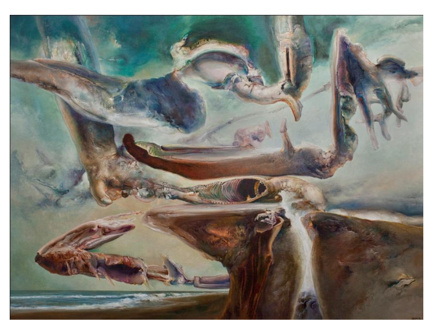
James GLEESON, Sky Divisions Gathering, 1989, oil on canvas, 196.6 x 262.5cm.

The following Annual Financial Statement and Notes reflect all of the above transactions.